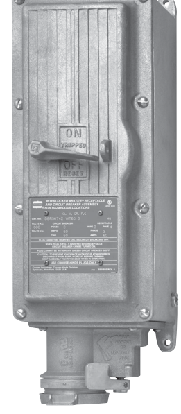
CAUTION: To reduce the risk of ignition of hazardous atmospheres, do not use plugs or receptacles in Class II, Group F locations that contain electrically conductive dusts

Dim. "b" and "bb" are exposed portion of plug when engaged with recentacle