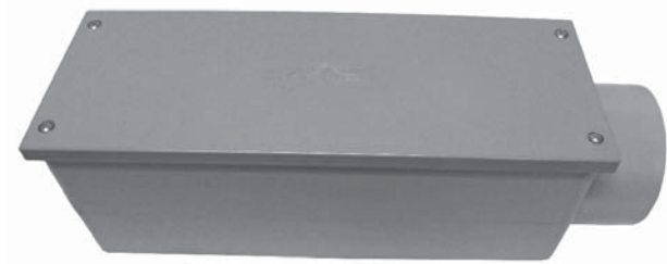
2-1/2" THROUGH 4"