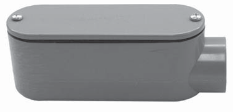
1/2" THROUGH 2"