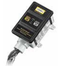
Manual Reset GFCI